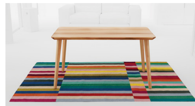
| Furniture and room interiors