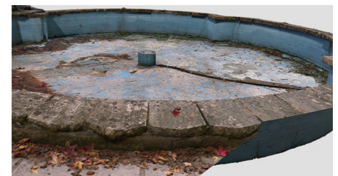
| Crime scenes