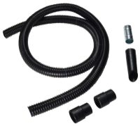
P12374 ATEX STARTER KIT Ø 40MM Basic kit containing antistatic accessories for application with 40 mm diameter ATEX vacuum cleaner