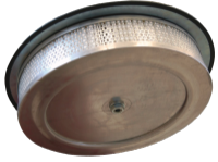
HEPA 14 Absolute filter (EN 1822-5)